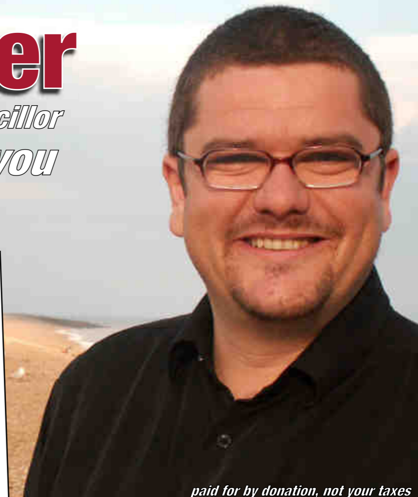
paid for by donation, not your taxes

Please let me know what you think. I always welcome your views. Best wishes.