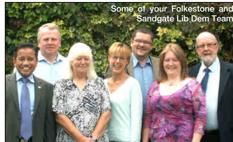
Some of your Folkestone and Sandgate Lib Dem Team

If you want to help the Lib Dems change Britain, why not get involved today.