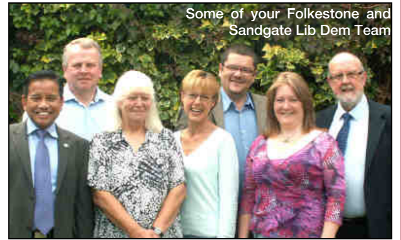
Some of your Folkestone and Sandgate Lib Dem Team

Nearly 7 million people backed Nick Clegg's Liberal Democrats in May's election. Now after 65 years of let downs with Labour and the Tories, things are starting to change with the Lib Dems in power. If you want to help the Lib Dems change Britain, why not get involved today.